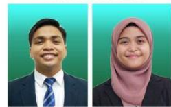
SAKHA (LAWS) MAWADDAH (LAWS)